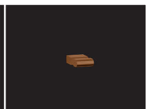
cloth hook KU-560