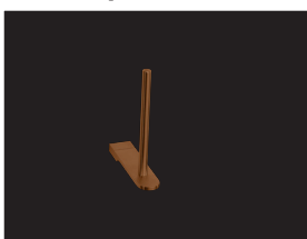
spare roll holder KU-390