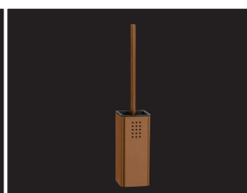
toilet brush holder KU-500