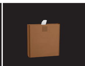
san. napkin disposal bin KU-400