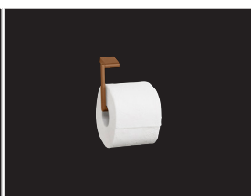
single toilet roll holder KU-380