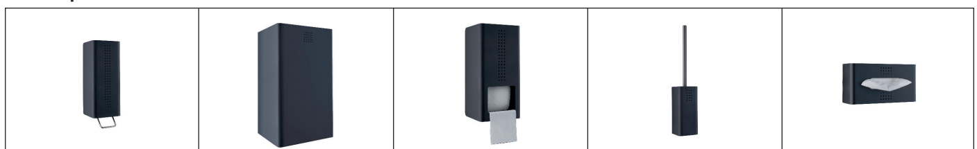
soap dispenser DP-140