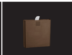
san. napkin disposal bin BR-400