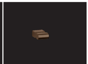
cloth hook BR-560