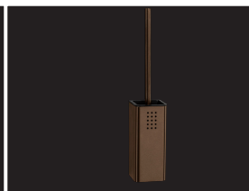
toilet brush holder BR-500