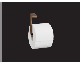
single toilet roll holder BR-380