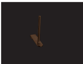
spare roll holder BR-390