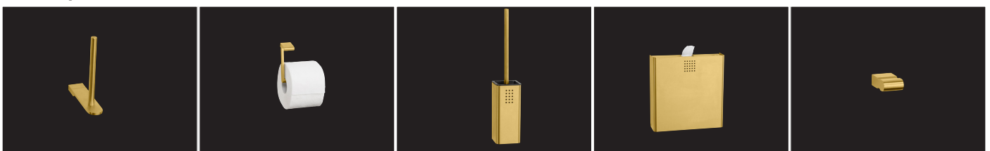
spare roll holder ME-390