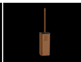
toilet brush holder KU-500