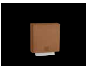
paper towel dispenser KU-100