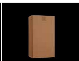
waste bin KU-200