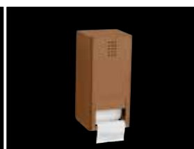
double toilet roll holder KU-300