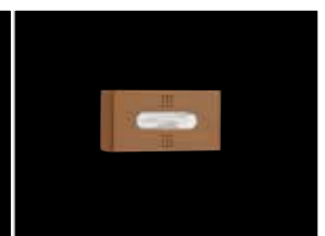
tissue dispenser KU-390