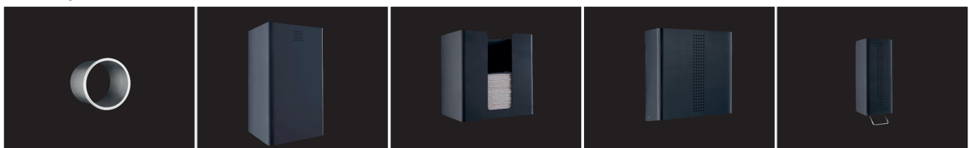
circular waste chute PU-280