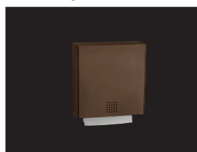
paper towel dispenser BR-100