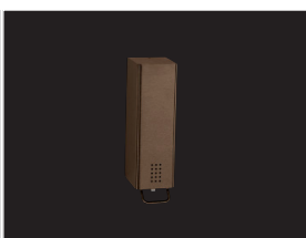
soap dispenser BR-140-LO