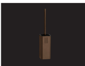
toilet brush holder BR-500