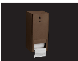
double toilet roll holder BR-300