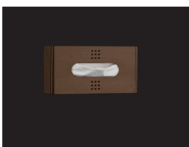
tissue dispenser BR-190