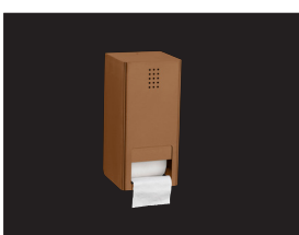
double toilet roll holder KU-300