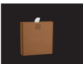
san. napkin disposal bin KU-400