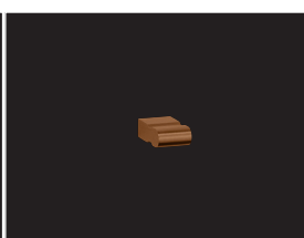
cloth hook KU-560