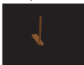
spare roll holder KU-390