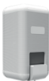
REF: PS33W Finish WHITE