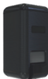
REF: PS33BK Finish BLACK