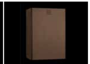
waste bin approx. 60L BR-245