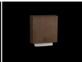
paper towel dispenser spprox. 800 sheet - BR-100