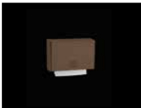
paper towel dispenser spprox. 550 sheet - BR-101