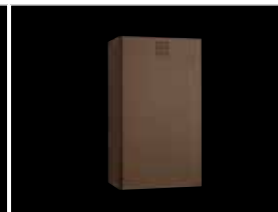
waste bin approx. 31L BR-200