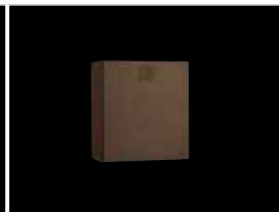
waste bin approx. 14L BR-230